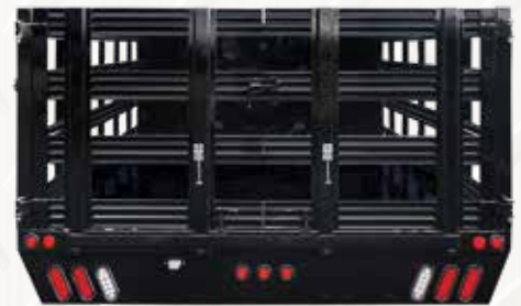
Shown with optional rear swing racks and full 10" light apron