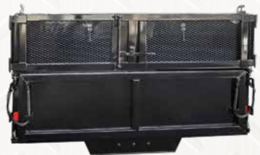
Optional dump tailgate and optional mesh on top doors