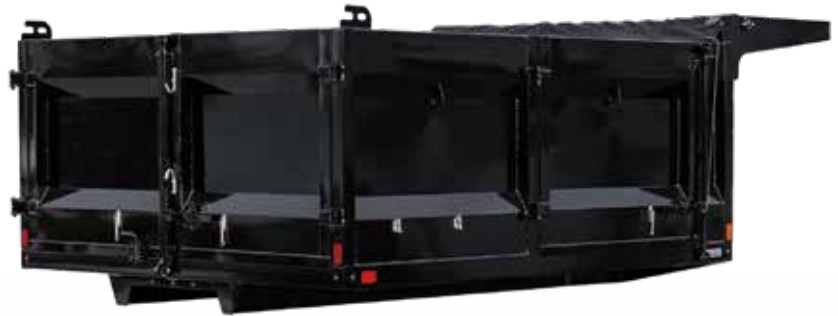
Shown with optional cab shield