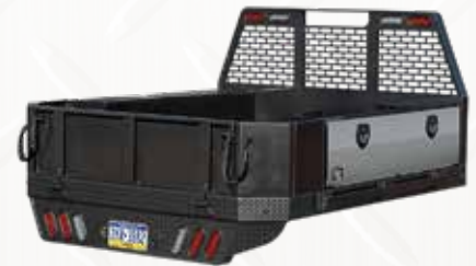
Shown with optional stainless steel toolbox lids