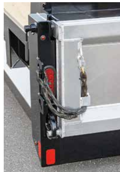
Rear Post Profile