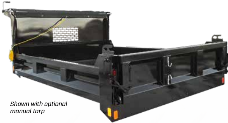
Shown with optional manual tarp