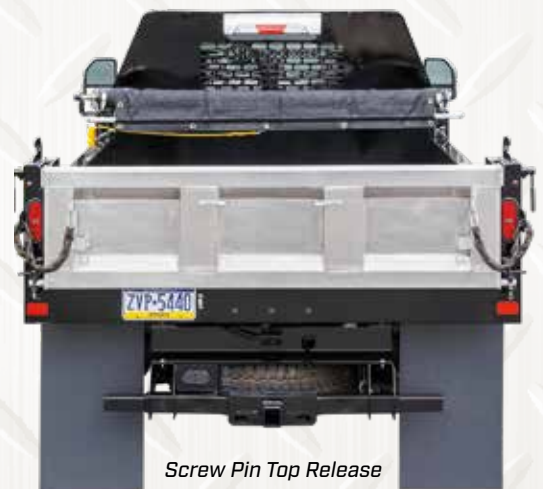
Screw Pin Top Release