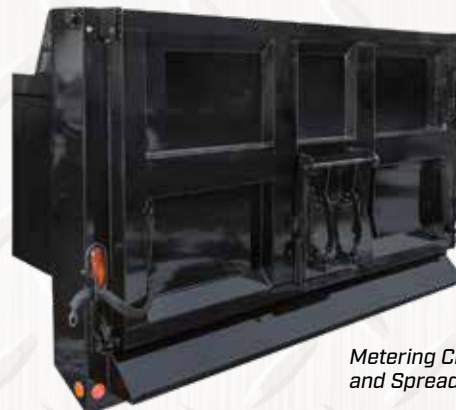
Metering Chute and Spreader Apron